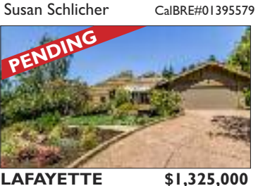
LAFAYETTE 3/2. Beautifully Updated & Private Single 6/5.5. Beaut. modern custom home w/ Level Home in Great Trail Location. CalBRE#01251227 wing. Must see!